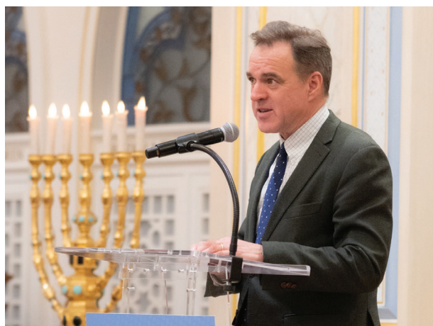
Niall Ferguson opens new Levy Forum season.

The first lecture in the new season, entitled "Cold War II or World War III? The New Threat to Western Civilization," was delivered on December 4 by historian Niall Ferguson to an audience of almost 900 attendees. He discussed the need to learn from history as we seek to maintain national security in the face of global unrest, saying, "The grotesque and antisemitic demonstrations that broke out on campuses and in cities from London as far away as Sydney were to me a reminder of why . . . history matters and cannot be allowed to be turned into some perverse sideshow in the identity politics circus of modern academia."